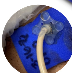
Under PEG, Trach Tube

To request samples email: daniel.skube@essity.com