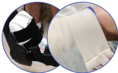
Under TCC & Compression