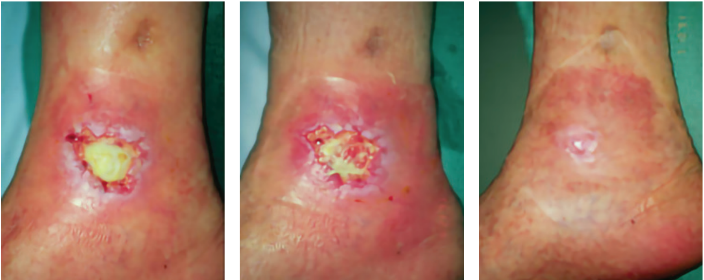
Figure 2: Wound showing progressive improvement over time, with decreased slough and redness (as well as edema management, as shown in the photos)

The wound needs to be examined using a standardized tool that identifies the anatomic location, shape, size, depth, edges, undermining, tissue type and amount, exudate type and amount, periwound tissue and degree of bacterial burden should be documented (Figure 2).