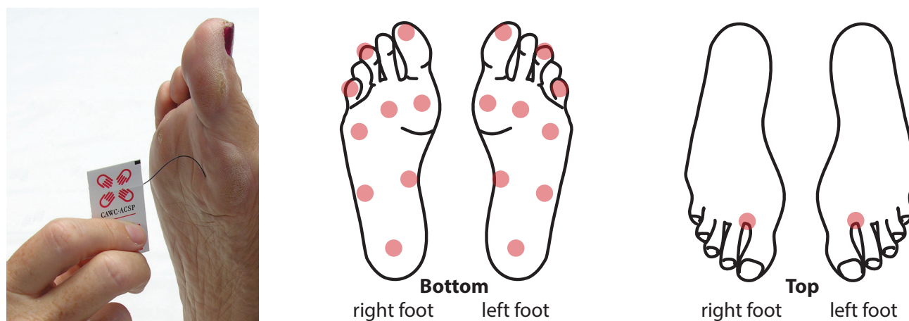
Figure 2: Monofilament Testing for Neuropathy