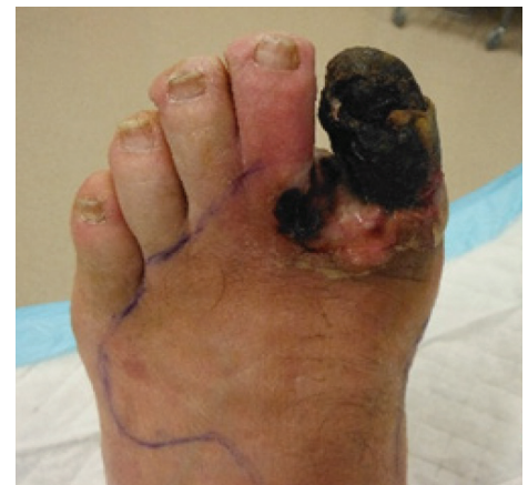
Figure 4: 57-year-old male with type 2 diabetes with sensitive neuropathy, waiting for revascularization

Figures 2–4 used with permission from Maryse Beaumier.