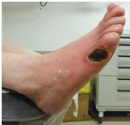
Figure 3: 51-year-old female with diabetes, heavy smoker, ischemic pain, TBPI: 20 mmHg