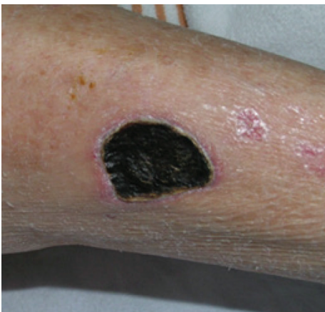
Figure 2: Large, dry arterial ulcer (eschar) on the leg of a male, heavy smoker, non-diabetic