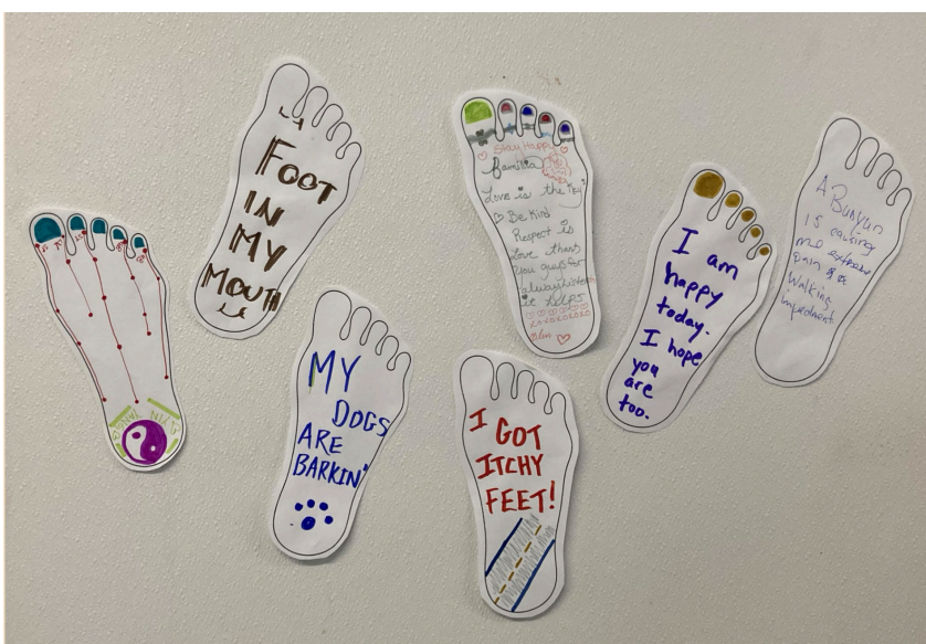
Figure 1: Community members at the Moss Park Consumption and Treatment Service in Toronto, Ontario engaging in foot care related art in response to the site's first visit by a chiropodist.

Focus on prevention including daily skin care, wound care for nails and feet, access to bathing and showering facilities, daily foot checks, access to footwear and dry socks. Treatments will depend