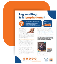
Leg Swelling: Is it Lymphedema?