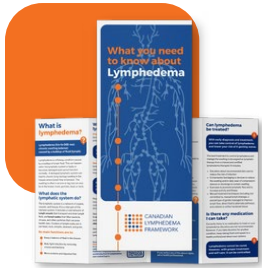
Lymphedema Education Pamphlet