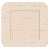
7.5 x 7.5 cm