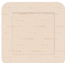
10 x 10 cm