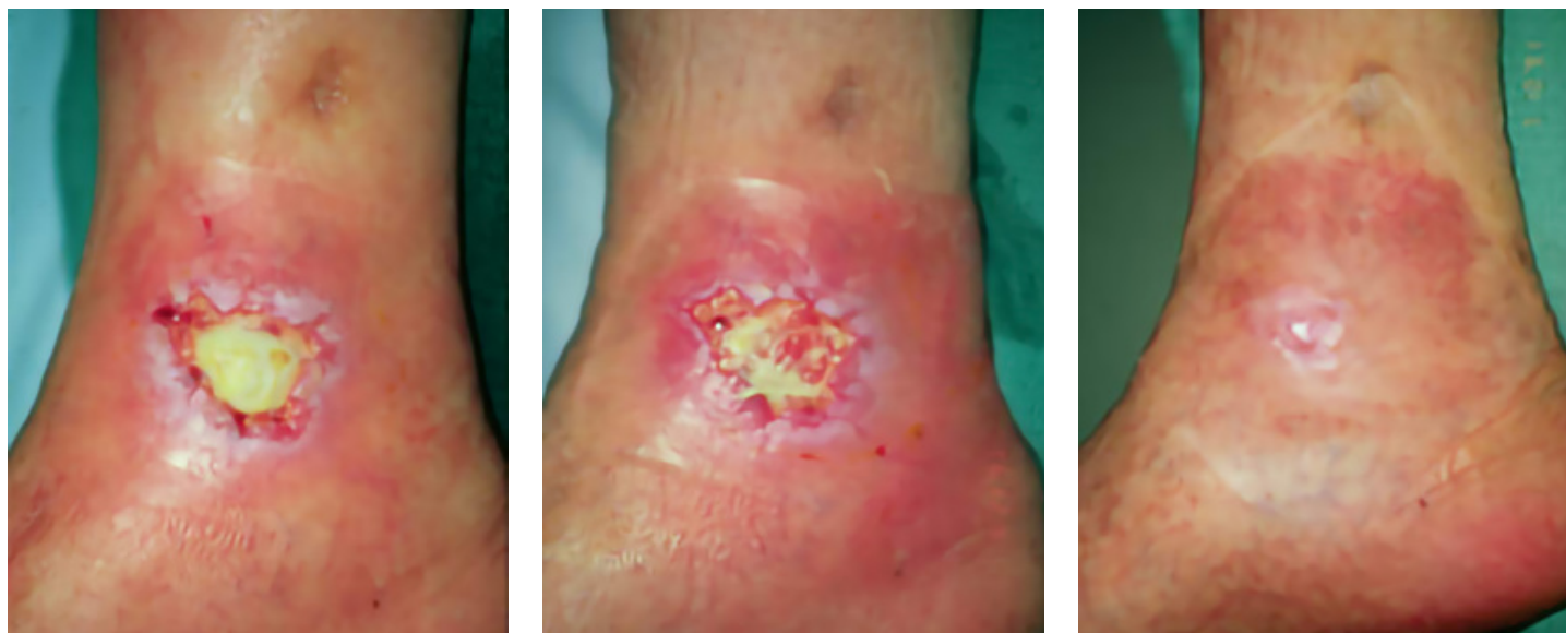
Figure 2: Wound showing progressive improvement over time, with decreased slough and redness (as well as edema management, as shown in the photos)

The wound needs to be examined using a standardized tool that identifies the anatomic location, shape, size, depth, edges, undermining, tissue type and amount, exudate type and amount, periwound tissue and degree of bacterial burden should be documented (Figure 2).