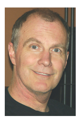
By Shane Inlow

hen it comes to the rate at which medical professionals checking the feet of people with diabetes (PWD), the results are very disappointing. Although no real "excuses" have been offered for this gross oversight, I suggest that the very ordinary business of medical professionals being too busy and seeing too many patients is most likely to blame in most cases.