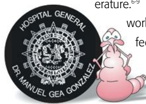
The medicinal maggot logo.