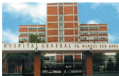
The Hospital General "Dr. Manuel Gea González," a National University of Mexico-affiliated teaching hospital. The wound-care centre is based within the Department of Dermatology, and wound care is taught as part of the dermatology residence.

"Maggot therapy offers several advantages to conventional wound care in rural and tropical regions of the world, where highly skilled surgeons, technologically advanced resources, or even electricity may not be readily available. However, we are not aware of maggot therapy now ongoing in any other countries, except perhaps as isolated events." 16