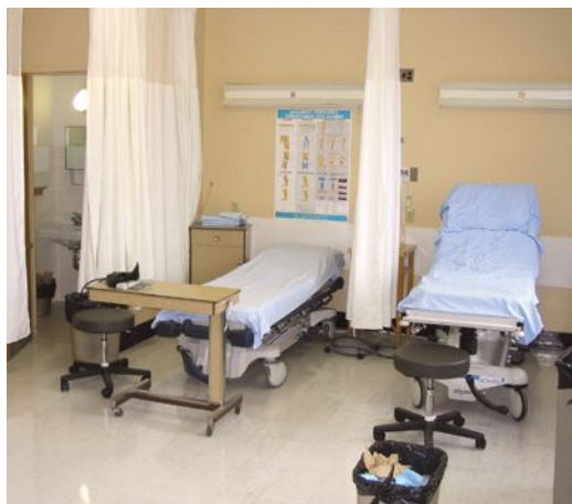
The examination room of the Complex Wound Care Clinic at the Centre Hospitalier Affilié de l'Hôtel Dieu de Lévis.