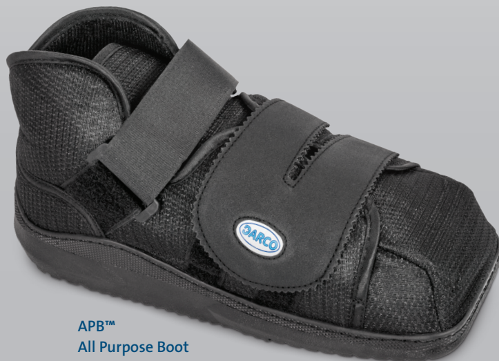
APB™ All Purpose Boot