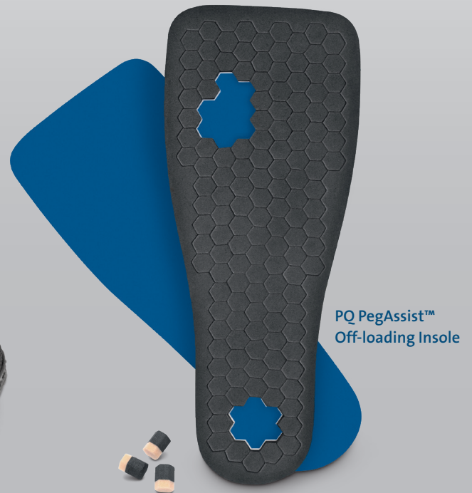
PQ PegAssist™ Off-loading Insole

The All Purpose Boot and PQ PegAssist™ combination provides a protective closed toe shoe with the excellent off-loading properties of the PQ insole. It's efficient as an off the shelf item, effective and provides great value for the clinician and their patient.