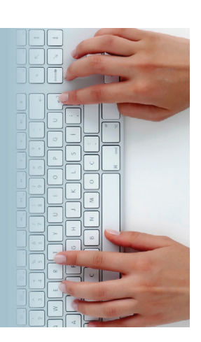
Volume 16, Number 1 · Summer 2018

Facebook: www.facebook.com/DiabeticFootCanada Twitter: @DiabeticFootCa