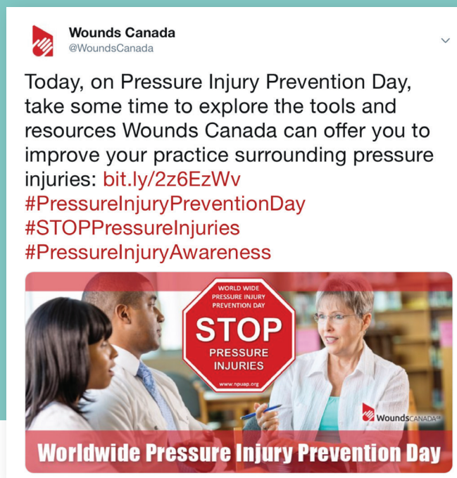
Figure 5: Example of a Stop Pressure Injury Day tweet

The Stop Pressure Injury Day annual event is an example of an international movement built by social media. In 2012, working with the European Pressure Ulcer Advisory Panel (EPUAP), co-author John Gregory helped establish the Twitter accounts and the #STOPPressureInjuries hashtags. Social media has helped build this annual November event to eliminate avoidable pressure injuries. Figure 5 is an example of a tweet containing event hashtags.