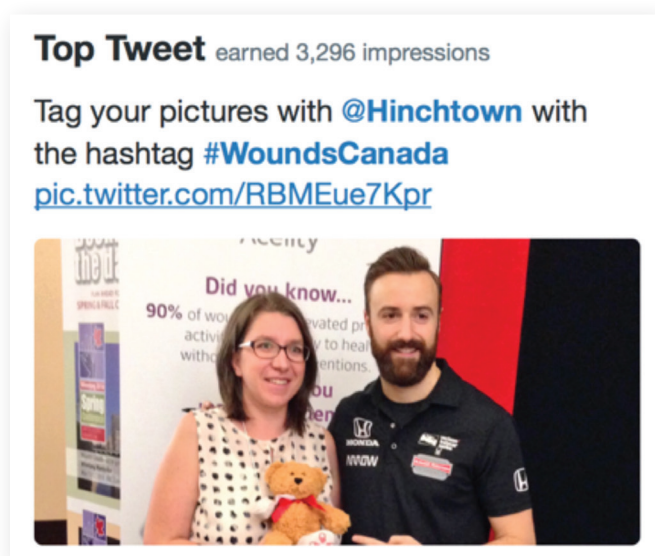
Figure 6: A tweet from the Wounds Canada 2017 Fall Conference tagging keynote speaker @Hinchtown