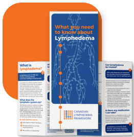
Lymphedema Education Pamphlet