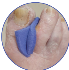
Areas with Yeast